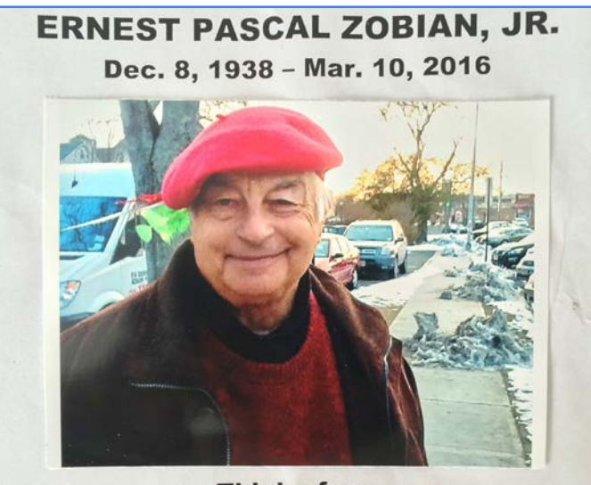
Think of me Think of me fondly