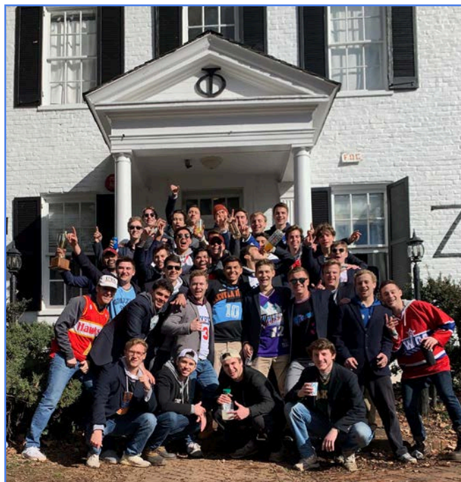
Bid Day 2020