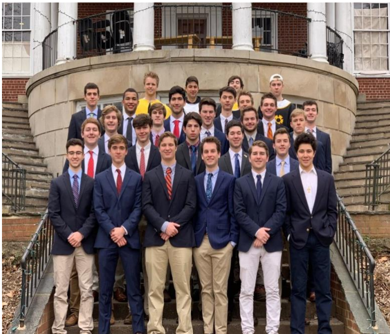
The new pledge class hails from all across the United States including South Carolina, California, Illinois, Texas, and New York among other locales.