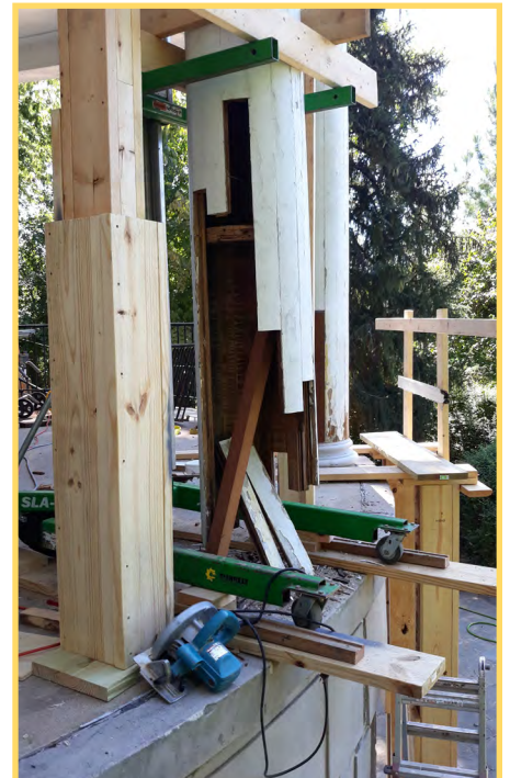
House column restoration