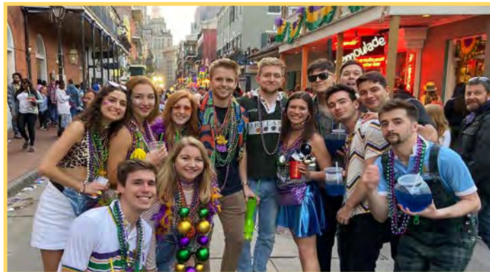
Eight of the class of '20 fourth-years at Mardi Gras just prior to the lockdown