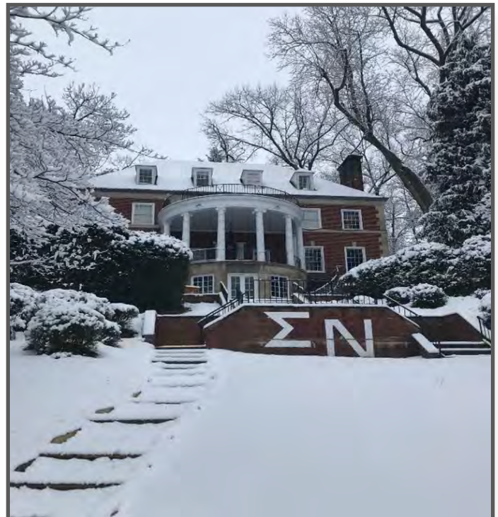
Beta Chapter's first January 2019 snow fall