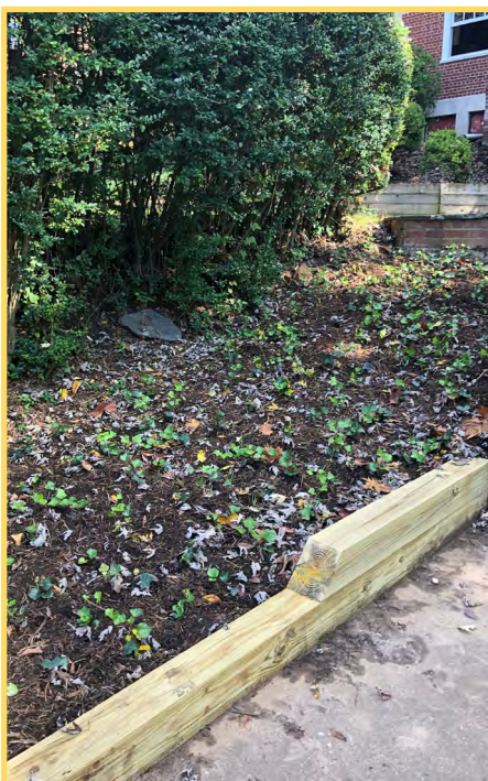
New ivy beds front stairs