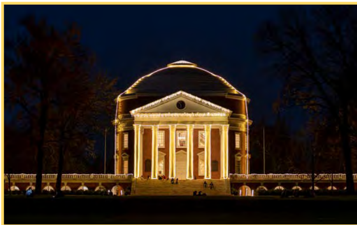
Annual Lighting of the Lawn 2020