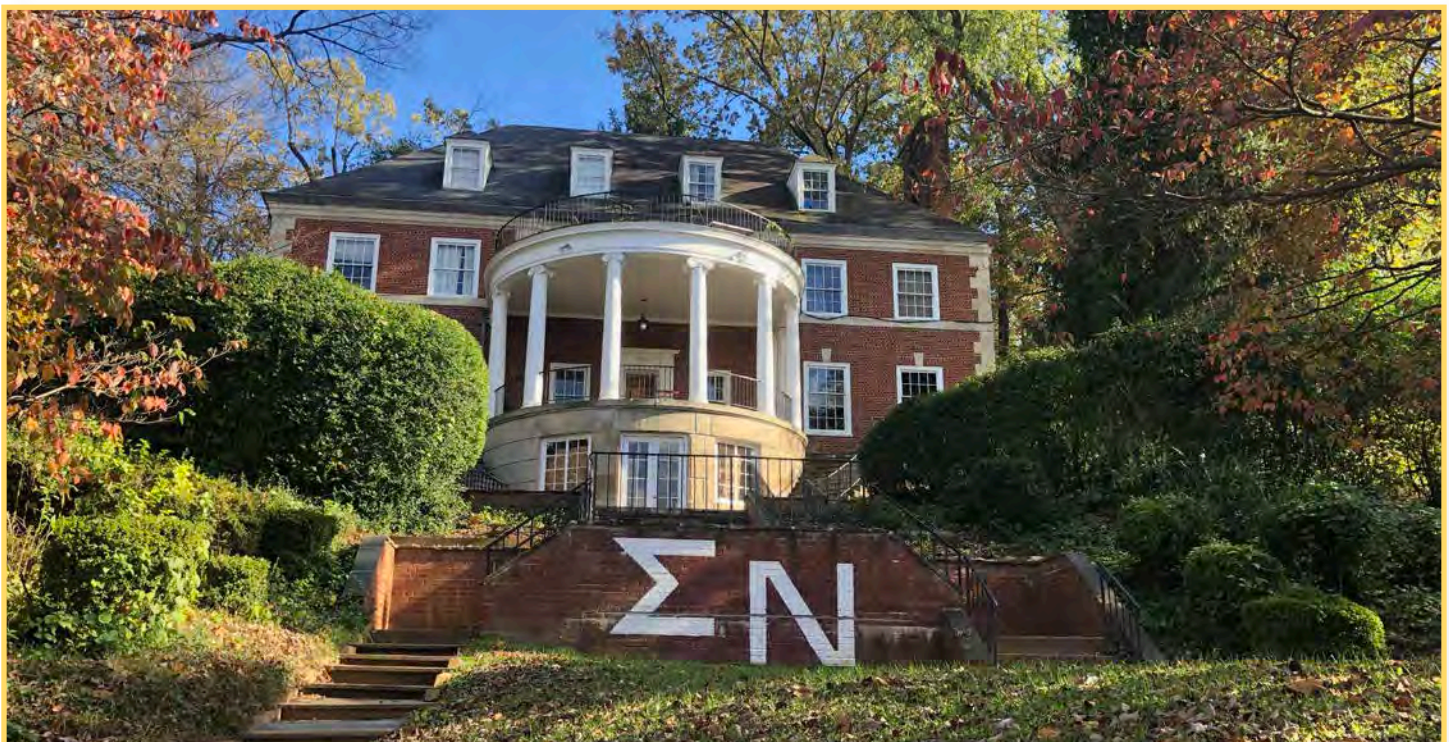
Beta Chapter House spring 2020 with new slate stairway