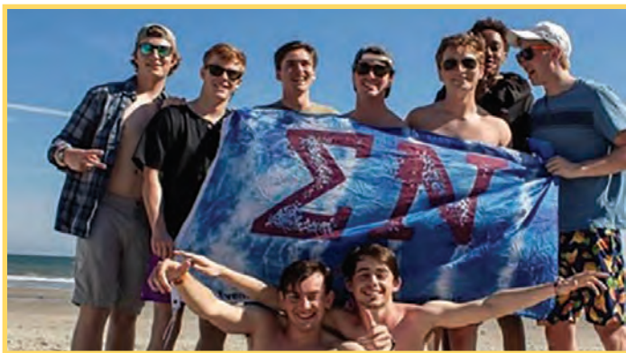
Beta brothers enjoy their weekend at Myrtle Beach, SC

In May, UVA welcomed back the class of 2020 to participate in in-person Final Exercises along with the class of 2021. The chapter was estatic to finish off the spring semester by hosting well-deserved graduation celebrations for our fourth-year members and 26 young alumni from across the country.