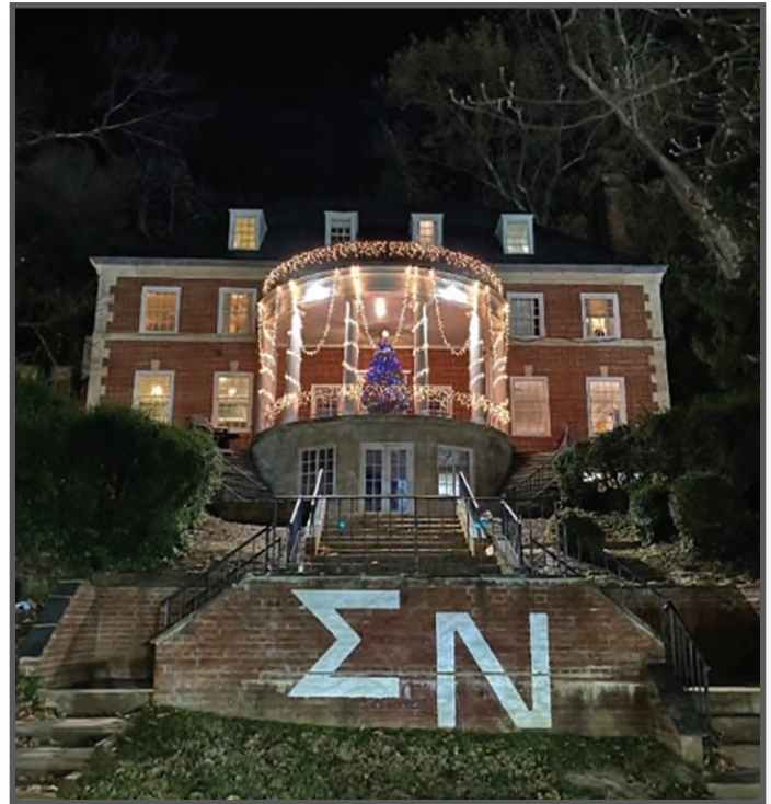
The brotherhood prepares the historic Beta Chapter house for the annual Christmas Formal!

The Beta Chapter of Sigma Nu Fraternity continues to grow into a diverse and formidable organization on the Grounds of our historic university. Since our rechartering in 2018, the chapter has unceasingly endeavored to set new standards of excellence for its members, advance chapter goals, and strengthen our involvement across the university. The current brotherhood owes a great deal of its success to the support and guidance of our treasured alumni. In this newsletter, we glimpse at the daily workings of the chapter in 2021 and reflect on a few of the interesting and exciting things that our Beta alumni continue to make possible.