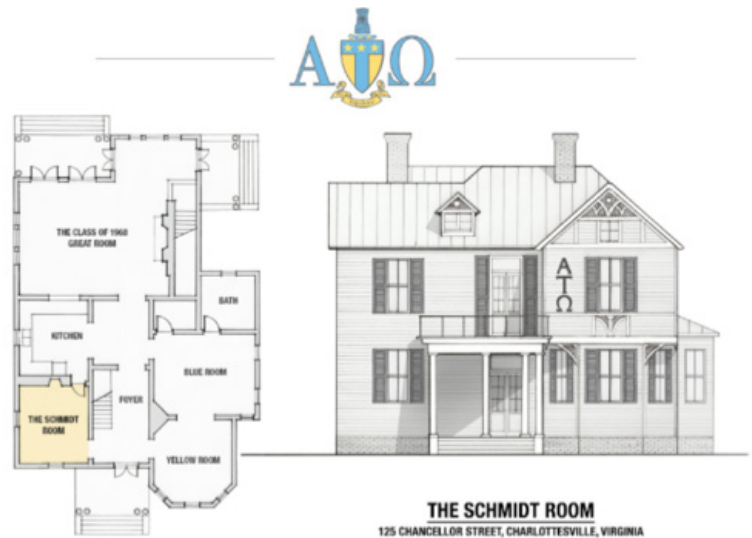
FRAMED ARCHITECTURAL PRINT