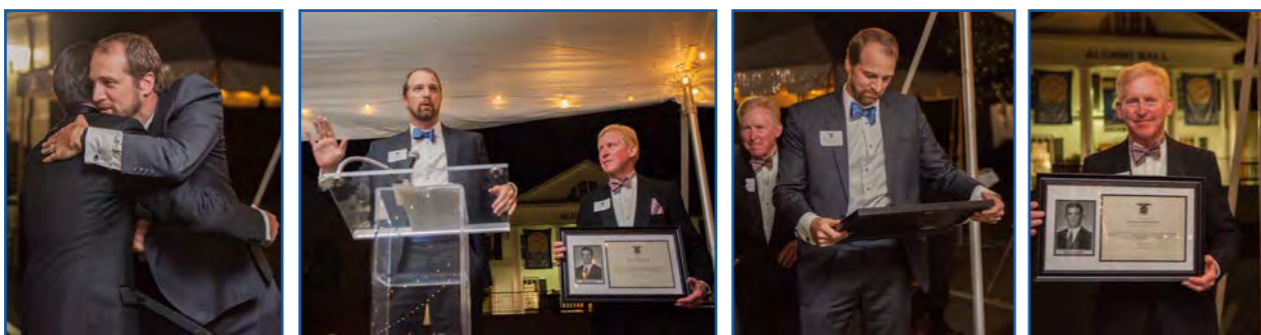
See pages seven & eight for DKE-Magoon Jefferson Scholarship donor list