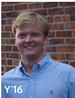
St. Christopher's School Richmond, VA

"St. Anthony Hall has been the center piece of my college experience, and I will forever cherish the memories and friendships made here. My time at the University of Virginia has passed by quickly, but the impact the Hall has made on my life will last forever."